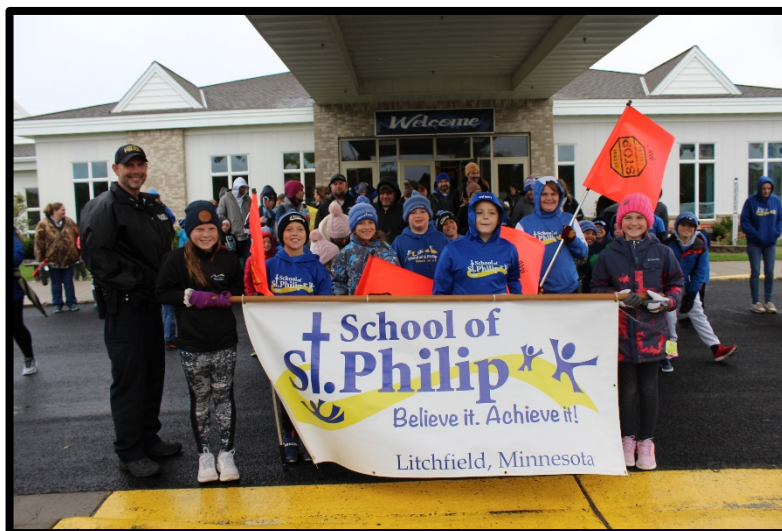
2023 Marathon—We raised $72,963.78