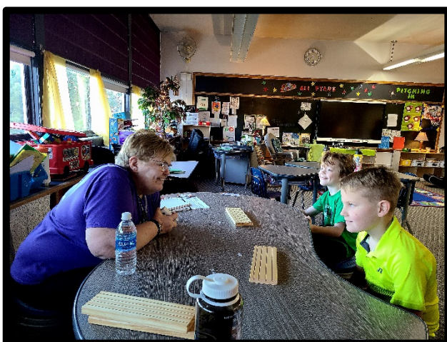
Community members volunteering at the school.