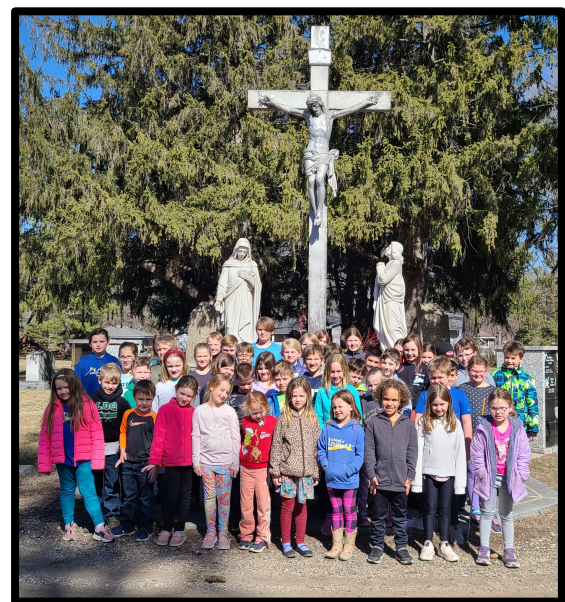
Lenten Stations of the Cross.