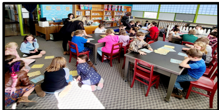
All-School Bingo for Catholic Schools Week.