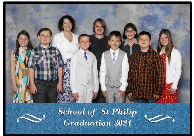
5 th Grade Graduates